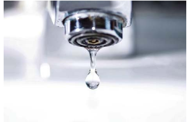
The SMGWA recently met to discuss water supply

Over the next 20 years, however, between 1995 and 2015, with a much slower population growth, only a 22 percent increase, combined with several factors- including the decommissioning of quarry operations,